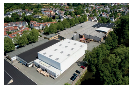
Company site in Asslar, Hessen

Our customers are active in the fields of electrical and electronics industry, telecommunication networks, electrical wholesale, automotive supply industry, audio and studio technology as well as medical technology and science.